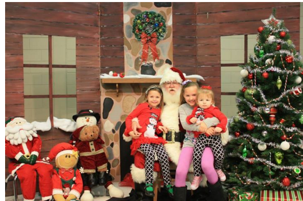
Sweets with Santa