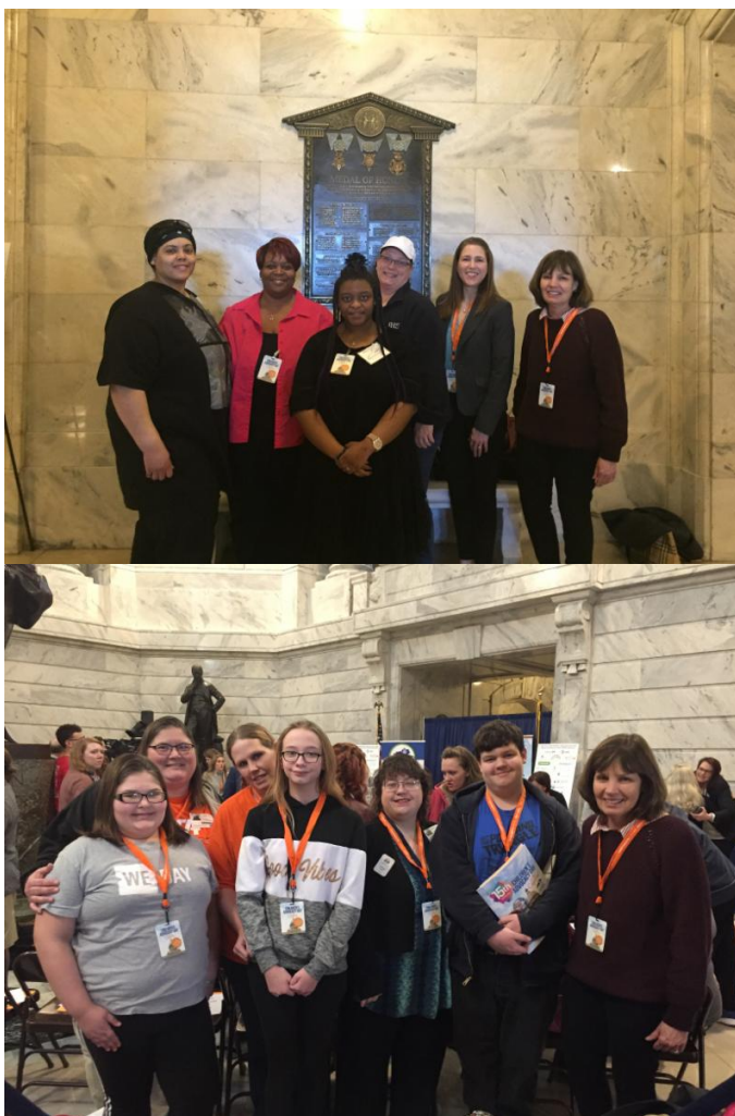
KENTUCKY PTA CALL TO ACTION