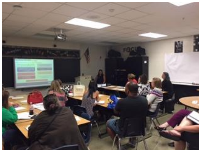
Attendees took advantage of several special specialized training sessions